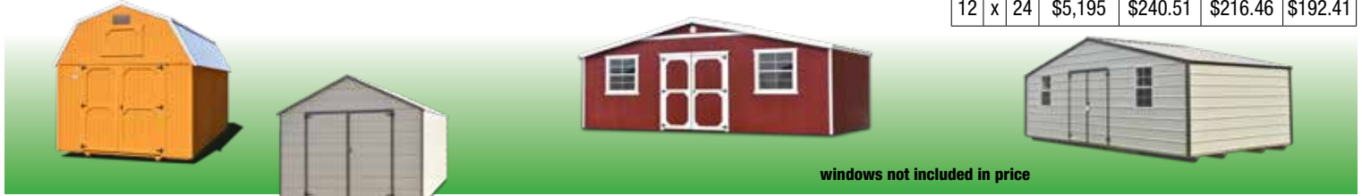
windows not included in price